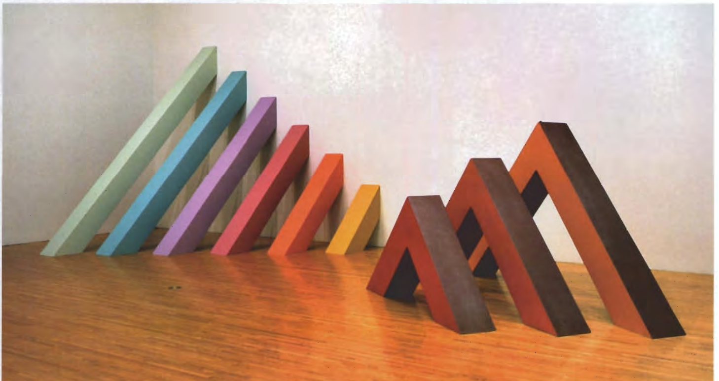
Rainbow Picket , latex paint on canvas and covered plywood, 10'6" x 9'2", 1965/2004 (left); Trinity , canvas, plywood, and sprayed lacquer, 60" x 128" x 63", 1965. Both from the exhibition "A Minimal Future? Art as Object 1958–1968," at Los Angeles Museum of Contemporary Art, March 2004.

"Jack and I made the poster as a lark to counteract the macho nature of the L.A. art scene, never imagining that Artforum would run it on a full page and turn our picture into an international emblem," Chicago recalls.