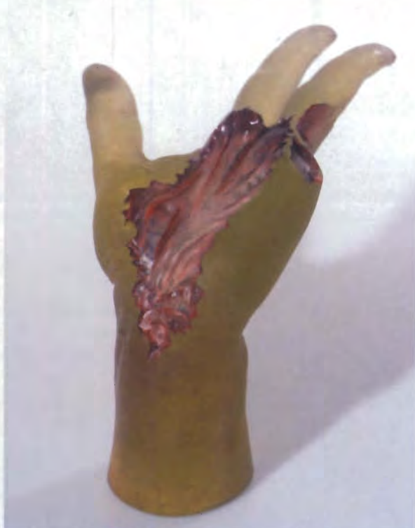
Chicago in her studio preparing cast-glass pieces for painting, 2006 (top). Study for Flaming Fist , watercolor, 12" x 9", 2006, with Grand Flaming Fist , cast glass, 22" x 8" x 8", 2006. Cast, etched, and painted glass, 8" x 8" x 5". Firing and etching by Dobbins Studio.