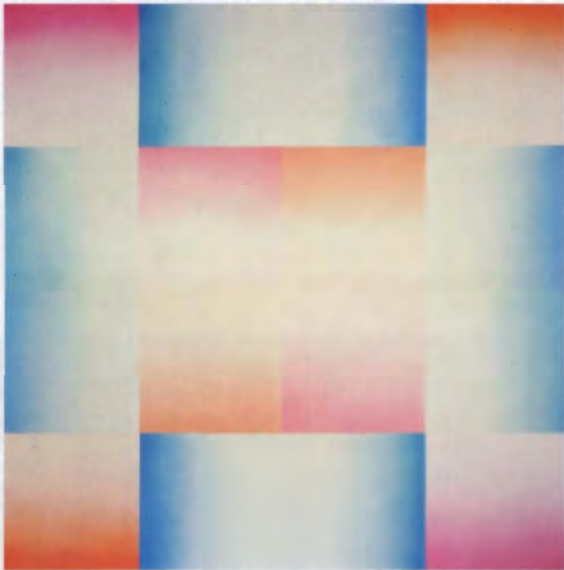
Big Blue Pink from "Flesh Gardens" series, sprayed acrylic lacquer on acrylic, 8' x 8', 1971.