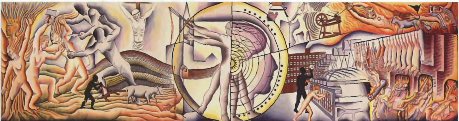
The Fall , modified Aubusson tapestry, 54'' x 18', 1993. Weaving by Audrey Cowan. Courtesy of LewAllen Contemporary, Santa Fe.