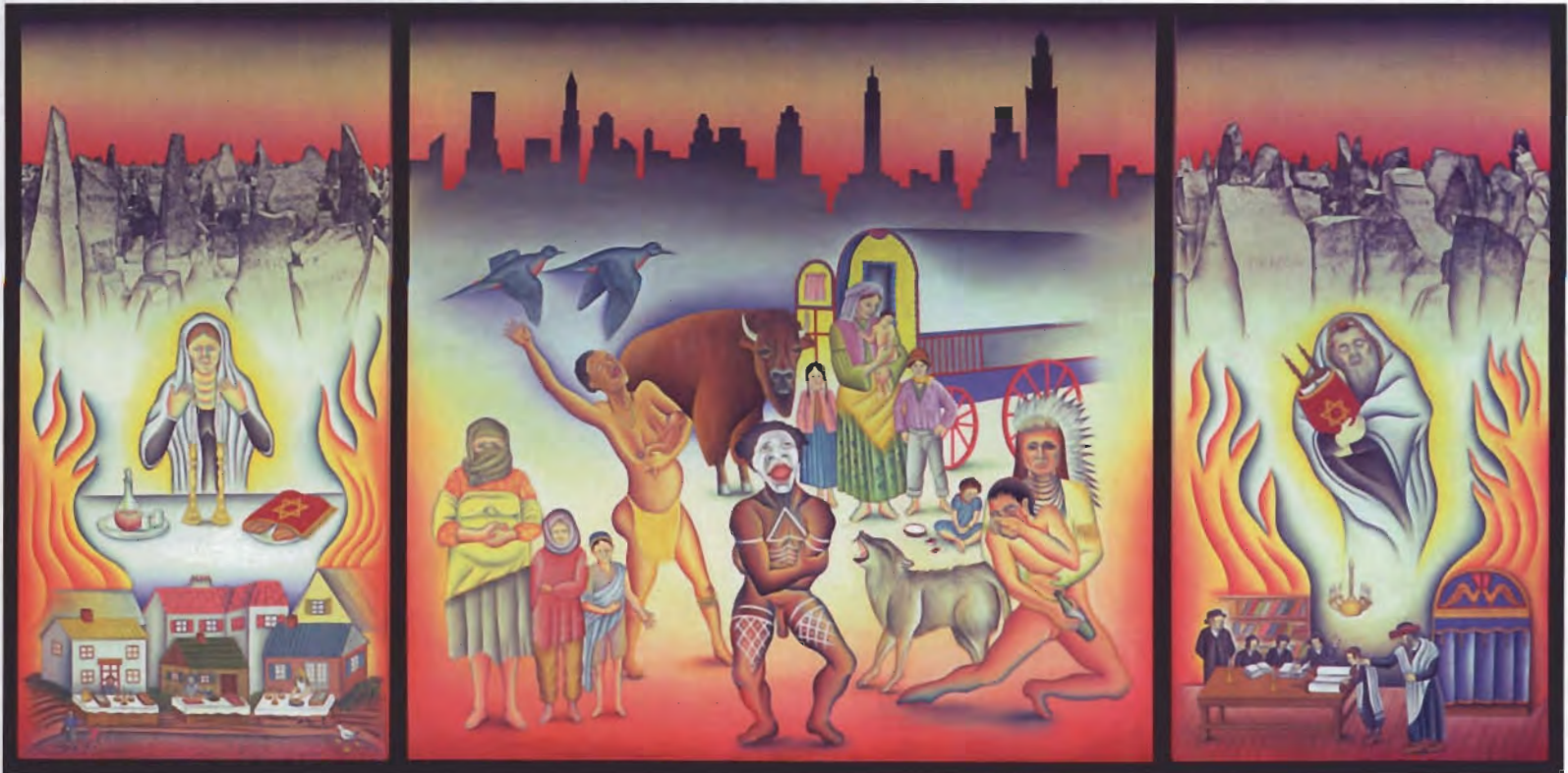
Treblinka/Genocide , sprayed acrylic, oil, and photography on photo linen, 42'' x 88'', 1988.